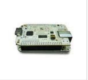
BeagleBone DVI-D Cape