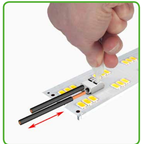
Inserting/removing fine-stranded conductors by lightly pressing on push-button.