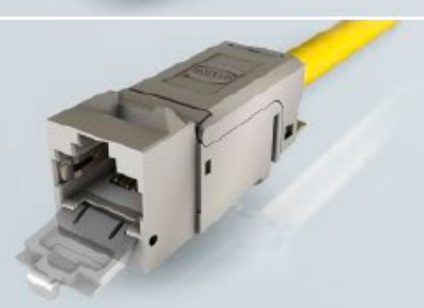
The Ha-VIS preLink® RJ45 Keystone jack For electrical cabinet patch panels and outlets