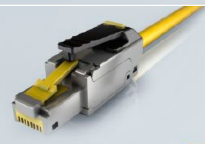
The Ha-VIS preLink® RJ45 connector For PROFINET connections