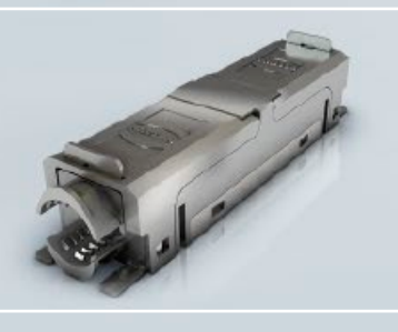
The Ha-VIS preLink® Extender For cable extensions and cable transitions: solid-stranded