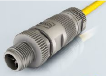
The Ha-VIS preLink® M12 X-coded connector For railway applications