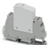
Type 3 surge protection, consisting of protective plug and base element, with integrated status indicator and remote signaling for single-phase power supply networks. Nominal voltage 24 V AC/DC.

Type 3 surge protection device - PLT-SEC-T3-24-FM-UT - 2907916