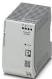
Primary-switched UNO POWER power supply for DIN rail mounting, input: 1-phase, output: 24 V DC/100 W

Please be informed that the data shown in this PDF Document is generated from our Online Catalog. Please find the complete data in the user's documentation. Our General Terms of Use for Downloads are valid ( http://phoenixcontact.com/download )