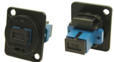
Part No. CP30215MB RS Stock No. 916-0246