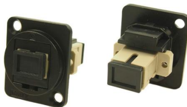
Part No. CP30216MB