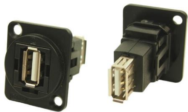
Part No. CP30208NMB RS Stock No. 916-0221

Description USB 2.0 A to USB 2.0 A, CSK hole.