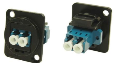
Part No. CP30213MB RS Stock No. 916-0233

Description USB 2.0 A to USB 2.0 B, CSK hole.