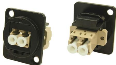
Part No. CP30214MB

Description LC Duplex SM adaptor, CSK Hole