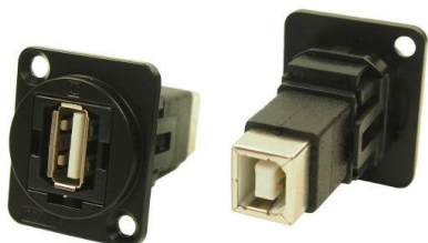
Part No. CP30209NMB RS Stock No. 916-0230

Description USB 2.0 A to USB 2.0 A, CSK hole.