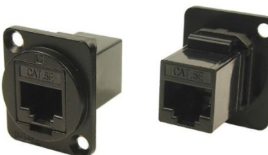
Part No. CP30220MB RS Stock No. 916-0243

Description UTP Cat5e RJ45-RJ45, CSK Hole