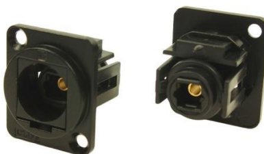
Part No. CP30217MB RS Stock No. 916-0249