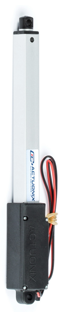
100mm L16 - Actual Size