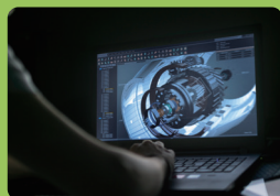
Professional graphics users