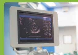
Embedded industrial applications