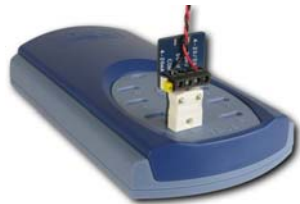
Figure 2: The terminal board fitted to the USB TC-08

The voltage displayed in PicoLog corresponds to the input voltage as follows: