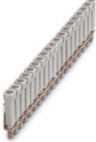
Jumper, Number of positions: 100, Color: gray

Please be informed that the data shown in this PDF Document is generated from our Online Catalog. Please find the complete data in the user's documentation. Our General Terms of Use for Downloads are valid ( http://download.phoenixcontact.com )