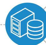
Asset Management Platform