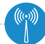
Wireless Service Provider