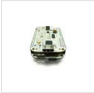
DVI-D Port (HDMI)