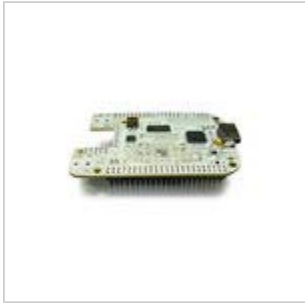
BeagleBone DVI-D Cape