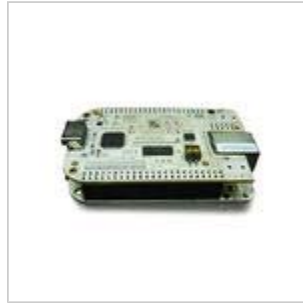
BeagleBone DVI-D Stacked