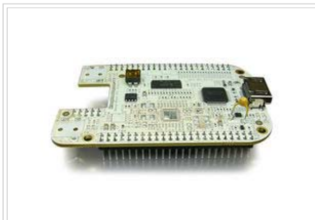
BeagleBone DVI-D Cape

The cape shown in the image to the right is a BeagleBone DVI-D Cape without audio features.