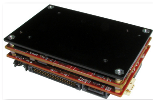
Heat plate models