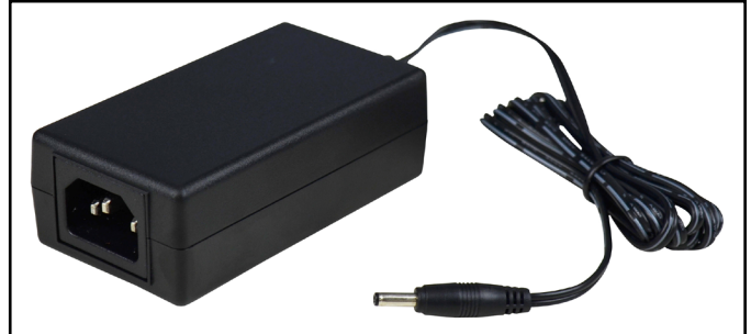
Figure 3. Universal power adapter included with the 19243 Mini Monitor

NOTE: The power cord must be purchased separately if ordering the 19243 Mini Monitor. The power cords are available as the following item numbers: