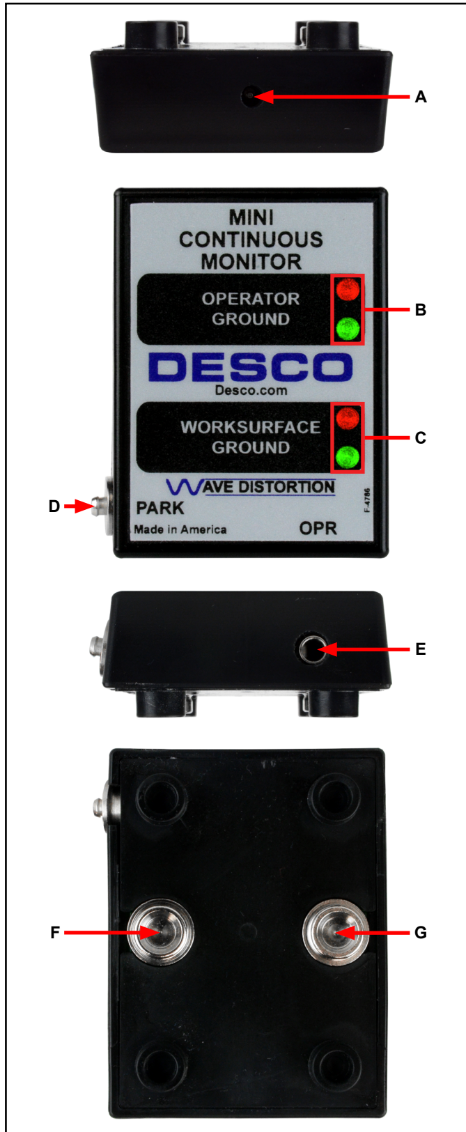
Figure 4. Mini Monitor features and components

A. Power Jack: Connect the included 24VDC power adapter here.