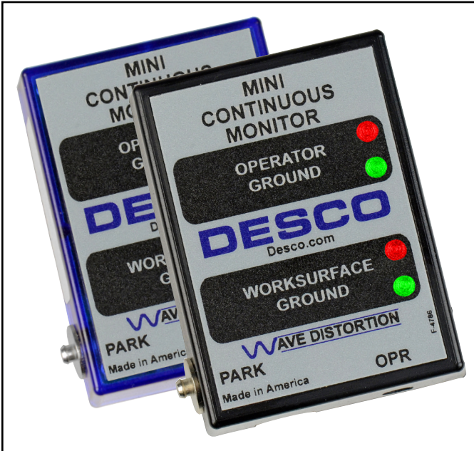
Figure 1. Desco Mini Monitor