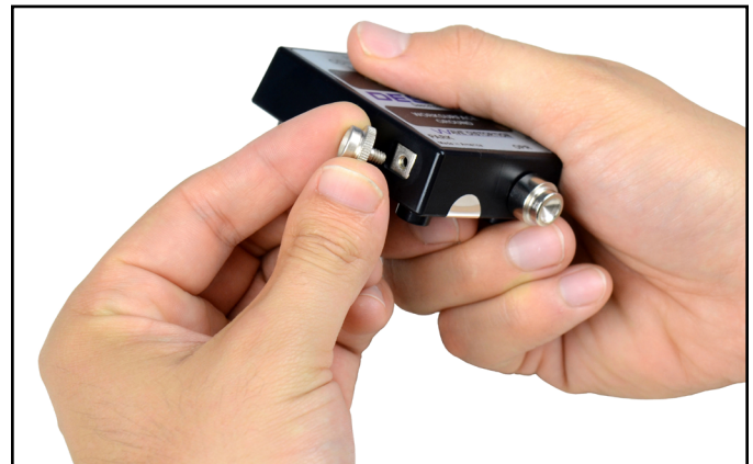
Figure 7. Changing the park snap on the 19243 Mini Monitor

The 19243 Mini Monitor includes an interchangeable 10mm park snap and 10mm banana jack adapter for operators who use wrist cords with 10mm terminations. Use the park snaps' knurled rims to unscrew the 4mm park snap from the monitor and install the 10mm park snap to the monitor. Plug the 10mm operator jack adapter into the monitor's operator jack.