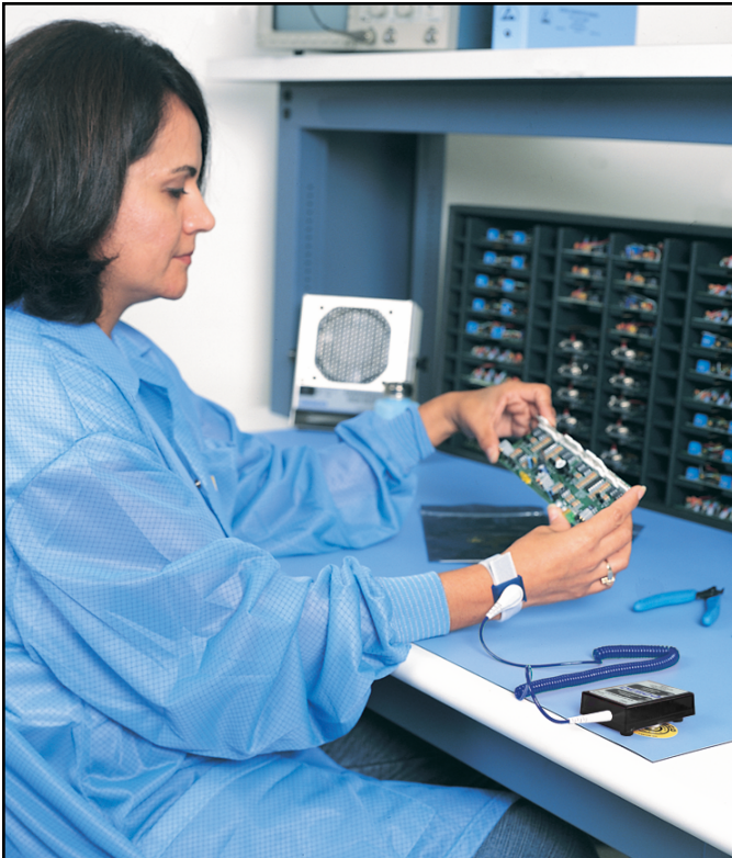
Figure 8. Using the Mini Monitor