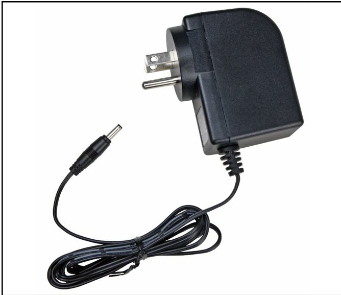
Figure 2. North American power adapter included with the 19239 and 19242 Mini Monitors