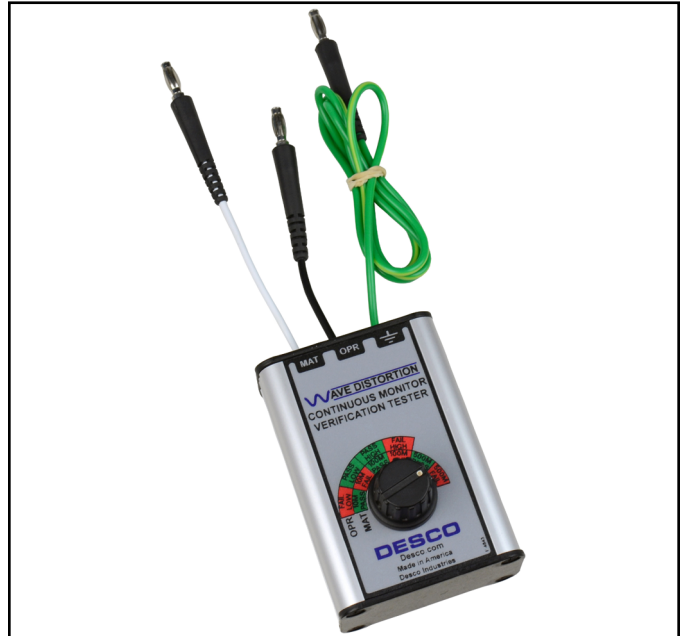
Figure 9. Desco 98221 Wave Distortion Monitor Verification Tester