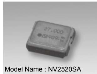
Model Name : NV2520SA