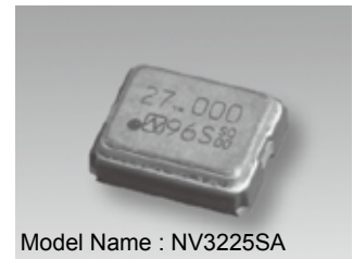
Model Name : NV3225SA