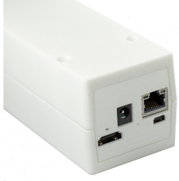
eCAM-i.MX connector view